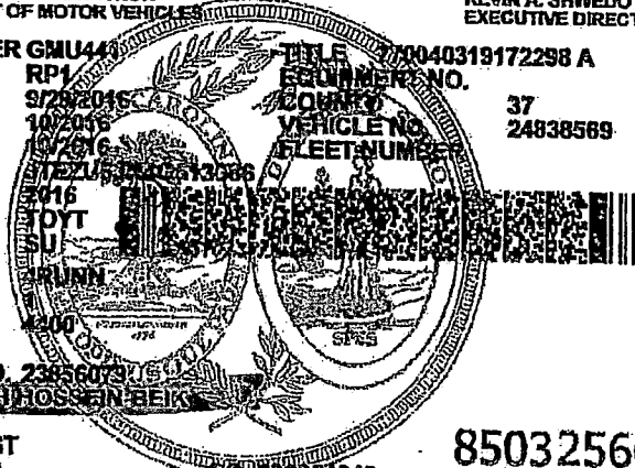
PLATE NUMBER GMU441 TITLE 201640319172298 A PLATE CLASS RP1 EQUIPMENT NO. 37 ISSUE DATE 9/29/2016 VEHICLE NO. 24838569 PLATE EXP. 10/2016 FLEET NUMBER DECAL EXP. 10/2016 VIN 5TEZU5E42Z0013086 YEAR 2016 MAKE TOYT BODY SU MODEL 4RUNN VEHICLETYPE EMPTY/GVW 400