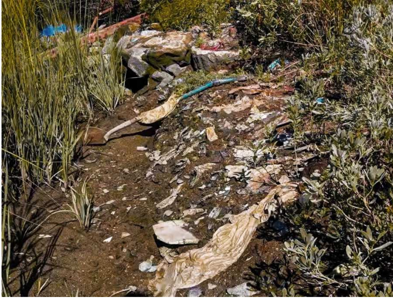
Fig. 4. Landfill debris in creek bed from Foundation Ex. 35. (R. p. __.)

Because the landfill was constructed and operated prior to the passage of the Clean Water Act and other modern environmental protections, it lacks many of the protective features now required for landfills, including a liner to collect leachate 3 and prevent public exposure to contaminants. 4 Mr. Ruocco sampled landfill leachate emanating from the creek banks at low tide, and testified to the laboratory analysis of the samples. (R. pp. __, __ (Tr. 1025:16-1028:7, 1030:13-1032:4).) 5 The leachate he sampled contained lead at