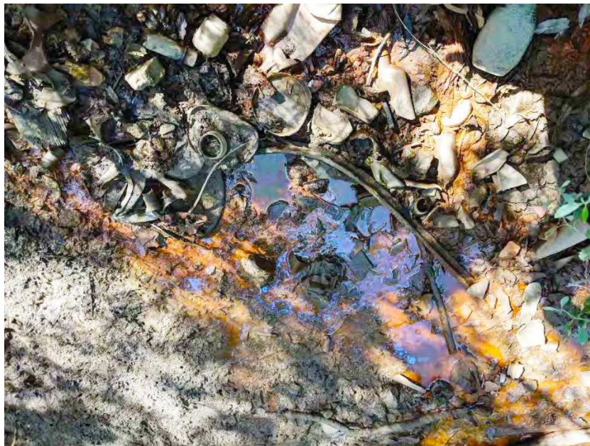
Fig. 3. Close-up photo of creek from Foundation Ex. 35. (R. p. __.)

degraded to the extent that landfill debris is becoming exposed. (R. p. __ (Order at 5).) Photographic and video evidence depicted trash throughout and layered beneath the critical area. (R. pp. __ (Foundation Ex. 35 at 30-32); R. p. __ (Foundation Ex. 36 (drone video)).) The Foundation's expert in wetlands sciences, Andy Ruocco, collected video footage of the critical area demonstrating the degree of waste present, and testified to finding unidentified metals, unidentified plastics, assorted building materials, and even medical wastes in the creek which he opined originated from the former operation of the landfill. (R. pp. __ (Tr. 983:25-985:9).) The ALC found Mr. Ruocco's testimony "convincing." (R. p. __ (Order at 5 n.4).)