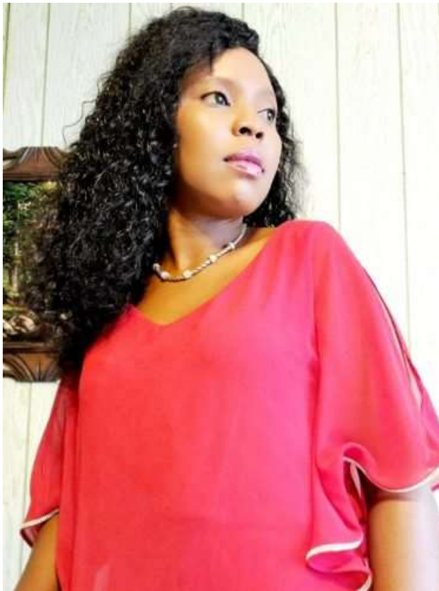
Queen Dorothy Amolo

How can a guard who worked with the minister for less than five weeks kill him in cold blood because of non-payment of allowance/salary? According to labour ministry spokesperson Frank Mugabi, the killer guard had just been deployed to the ministry and attached to the minister three weeks ago.