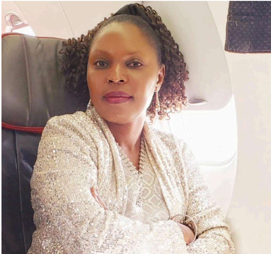
Queen Dorothy Amolo

She described the murder of the fallen minister as a direct hit on the development of young people, women, and vulnerable groups in Lango, Oyam district specifically.