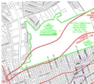
State’s Ex. 25 (R. V. 1, p. 233 and enlarged)

This area depicted on the Courtney Plat at State’s Exhibit 25 (R. V. 1, p. 233 and oversized) and described as the “pig’s ears” and “dome of the pig’s head” and an adjacent strip are outside the boundaries of the 200 acre 1786 Morrall grant to that area. This area is shown in the section of Exhibit 25 pasted below as highlighted by the line in the upper left (green if viewed in color) and bordering on the bolder line below (red if viewed in color). Although this area may be identified on the reduced version of this plat at State’s Ex. 25, the identifiers are more readily visible on the enlarged version of the plat (R. V. 1, p. 233) that shows the area as just to the right of Creek Front Rd., below Marsh Ct. and above the redline of the 200 acre grant overlay.