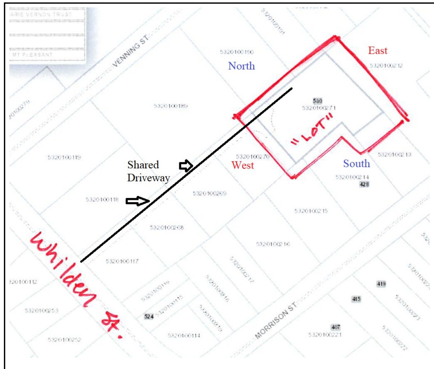
Fig. 1 – The Lot