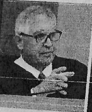
Judge Danny Singleton