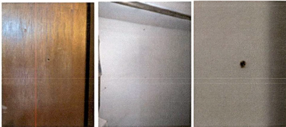
Bullet hole in my closet door and through the back wall of the closet