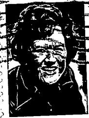
Julia Child FOREVER USA 2014

GREENSBORO NC 274 FEDMONT TRIAD AREA 14 NOV 2014 PM 3 L