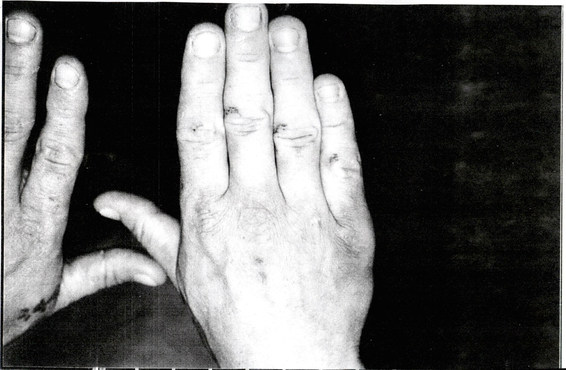
EXHIBIT Petitioner 7 Tyler 100