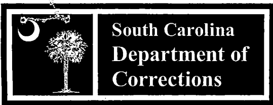
Exhibit no.: 4