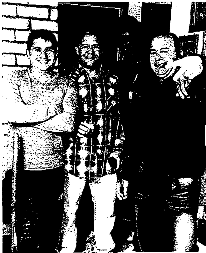
Armando Moreno Despaigne's Phot... in Mobile Uploads