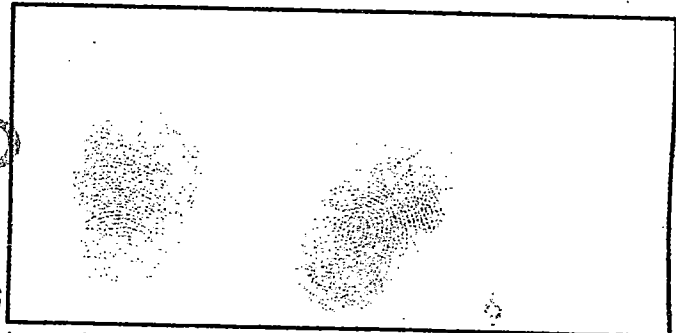
Inmate thumb & index fingerprints required.

RECEIVED DEC 07 2017 SC Court of Appeals