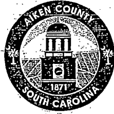
EXHIBIT B-2 F

Aiken County Clerk of Court P. O. Box 583 Aiken, S.C. 29802-0583 Phone: 803-642-1715