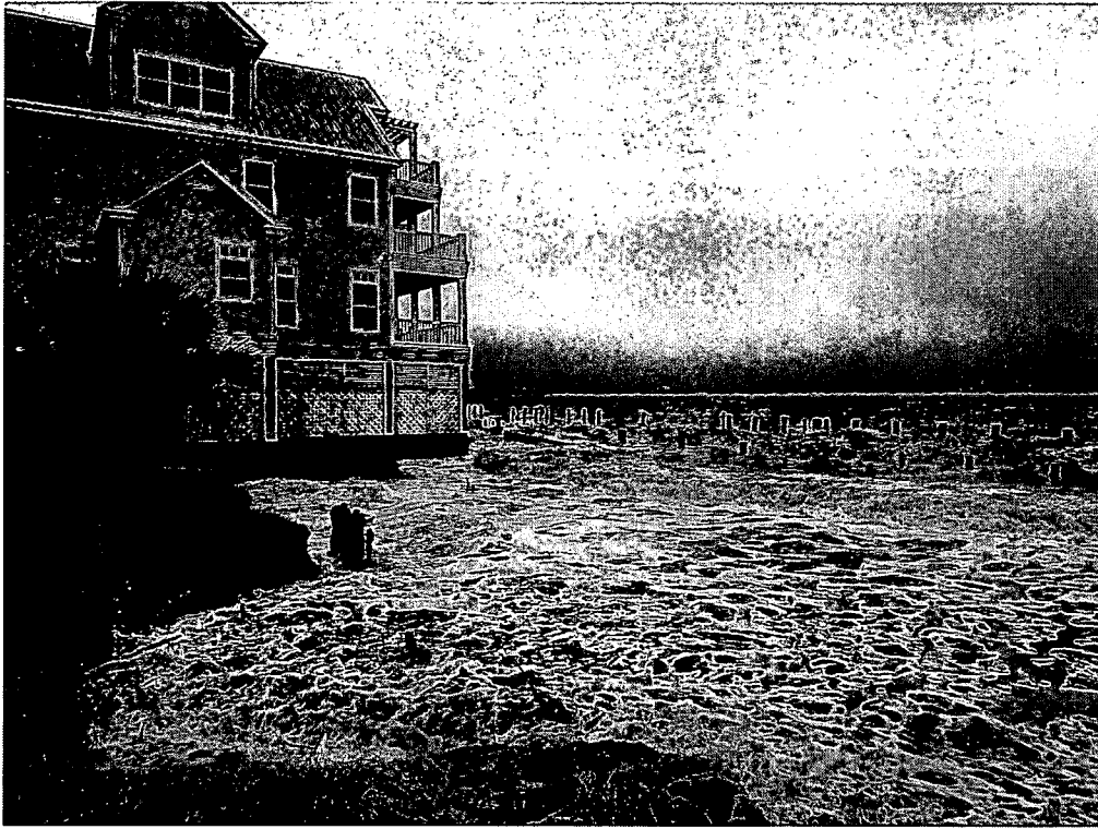
Image 1(above) Halwig Residence, South Side. Image 2(below): Halwig Residence, North Side