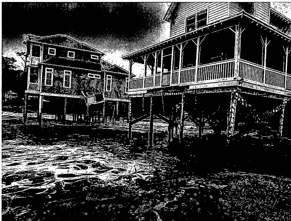
Image 5: Abandoned Properties Immediate South of Noller Residence (formerly 29 and 33 Driftwood Cottage Lane)

(See Testimony of M. Guastella p. 2, line 19 to p. 3, line 5, beginning at R. p. 53) The dwellings at 29 Driftwood Cottage Lane and 33 Driftwood Cottage Lane (pictured below) are the last two homes before the Appellants’ dwellings and both have been abandoned, as Mr. Guastella testified. (Id.) (R. p. 27 (photo below))