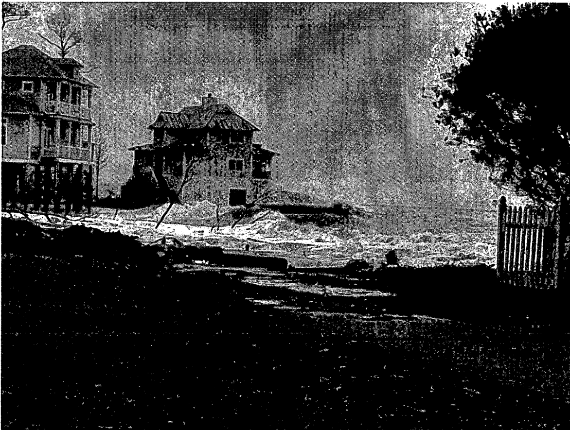
Looking North at 29, 33 and 36 Driftwood Cottage Lane Exhibit JFG 5 (1 of 6)