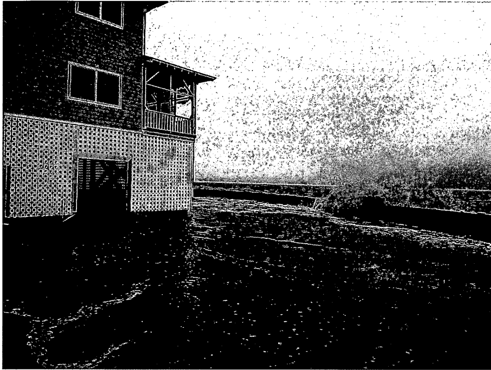
Image 3(above): Noller Residence South Side. Image 4(below): Noller Residence North Side.