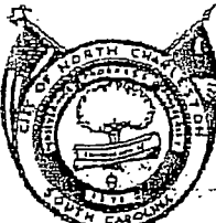
EXHIBIT A EXHIBIT B EXHIBIT C