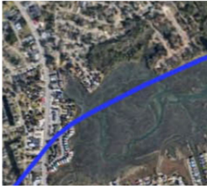
Plaintiff's Ex. 1, p. 9 (R. p. *)