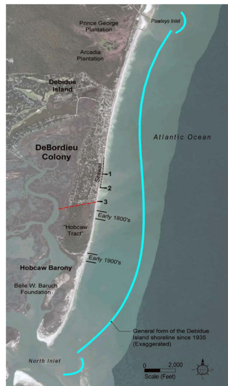
Illustration 2 Shape of DeBordieu Colony

As shown in Illustration 2, Debidue Island has an S-shaped beach and, as would be expected, experiences increased erosion along the bulged southern shoreline. Indeed, Debidue Island is one of the few places in South Carolina where the “gradient” in the erosion rate dramatically increases from the north to south, which is consistent with the conditions that would be expected based on the island’s shape and the north to south wave movement. (R. pp.485, 785-86, 787, 806-07, 813) (Tr. p.71, ll.4-24; p.371, l.24-p.372, l.1; p.373, ll.19-24; p.392, l.22-p.393, l.4; p.399, ll.5-7). Although the northern part of Debidue Island has a low erosion rate and actually accretes sand in some years, the erosion rate at the southern part of DeBordieu Beach is much higher, and waves in that area tend to carry away