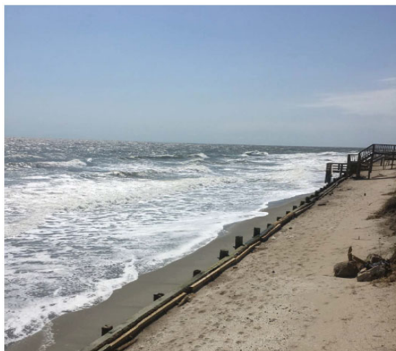
Illustration 3 DeBordieu Colony Bulkhead

around 1970 and involved construction of two timber groins along Hobcaw Tract. See (R. p.1358) (Resp’ts’ Jt. Ex. 1g, p.15). 9 However, the structures were not maintained or adequately protected from scour 10 and failed by the early 1980s. ( Id. ). A sand-scraping program was started in the mid-1970s, using sand from the wet beach to form a protective dune after storms or other erosive