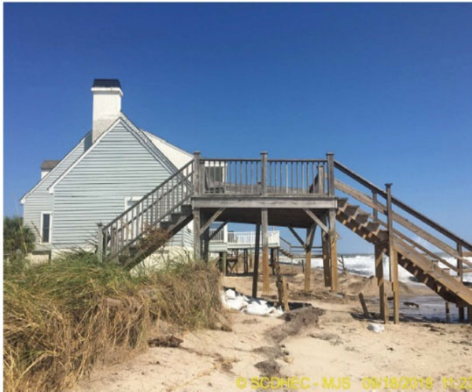
Illustration 5 Receded Vegetation Line

demonstrates that structures behind the bulkhead, the bulkhead itself, and several houses south of the bulkhead are all threatened by erosion. The evidence shows that water repeatedly encroaches on several homes and regularly overtops the bulkhead. For example, Respondents’ Joint Exhibit 31 includes 16 pictures of the Project area taken in September 2019. (R. pp.054-69).