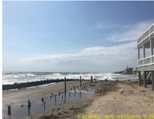
Illustration 7 Bulkhead and High Tide Line