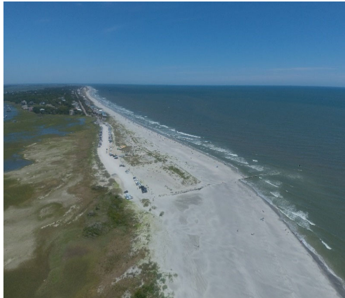
Illustration 4 Folly Beach Groins

groins looks like as placed on Folly Beach. 27 In addition to being more aesthetically pleasing than traditional groins, such as those installed at Pawleys Island or other locations in the State, the effect of the modern low-profile design is to allow excess sand to move around and over the structures to provide sand to the downdrift beach. ( Id. ); see also (R. pp.591, 679, 901) Tr. p.177, ll.12-23; p.265, ll.17-22; p.487, ll.8-25). 28 As they are engineered, “[m]ost of the structure[s] will be buried”